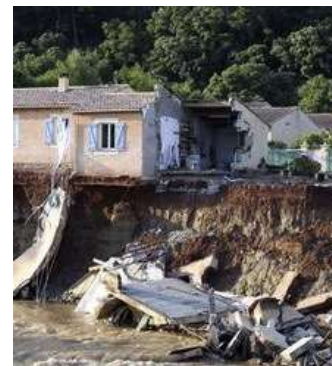
D. Natural disasters