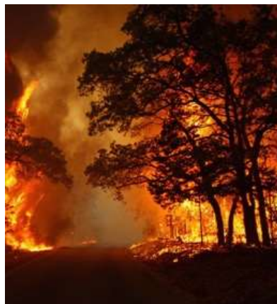
C. Vegetation fires