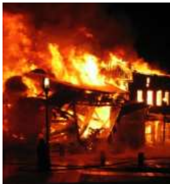
B. Structures fires