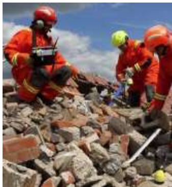
A. Search and Rescue (SAR) and emergency Medical Response